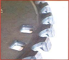
Figure 16 Close-up view of exciter ring with angle teeth that is only used with front covers that have crank position sensor coming in at an angle.