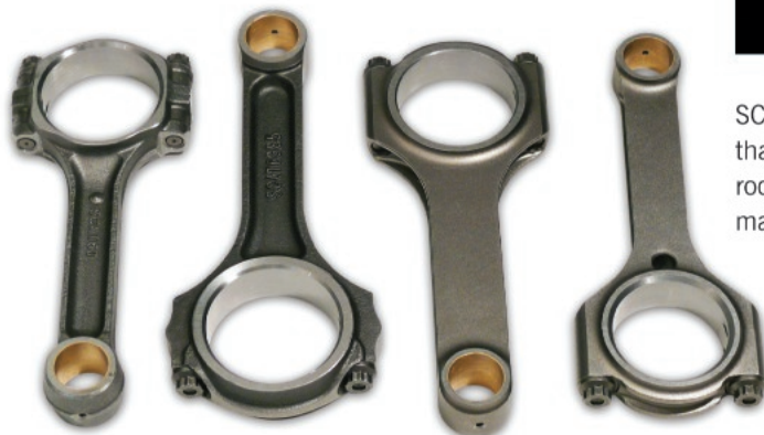
PRO STOCK PRO COMP PRO SPORT ULTRA-LITE

SCAT connecting rods feature the same high-quality craftsmanship that has led us to the forefront of the performance industry. SCAT rods are made from a 2-piece chromoly steel forging to ensure maximum strength and durability. We offer a complete line of Small and Big-Block Chevy, Small and Big-Block Ford, Honda and many more in both the I-Beam and H-Beam designs. Precision finished at SCAT on the newest and most modern machinery available by SCAT's master machinists.